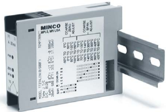
TT274 Thermocouple Temperature Transmitter

Type K: 150 to 1200^{\circ}\text{C} ( 270 to 2160^{\circ}\text{F} ).