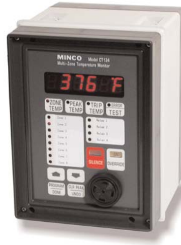
CT124 8-channel Temperature Monitor

Each relay has its own trip temperature, either high or low, and may be programmed to react to any or all scanned input zones. Relays may control cooling fans, remote alarms, contactors, or programmable controller inputs. You can set the audible alarm to sound when certain relays trip, and also at its own setpoint. The silence button quiets the alarm for a programmed length of time.