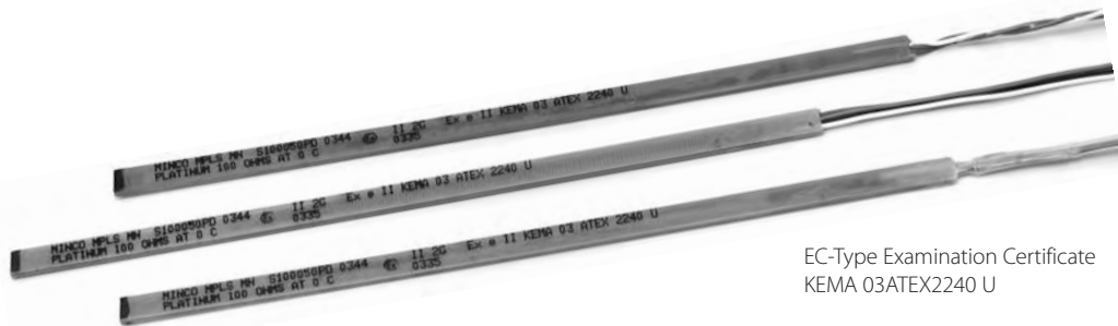
EC-Type Examination Certificate KEMA 03ATEX2240 U