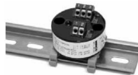
Temptrons mounted to DIN rail