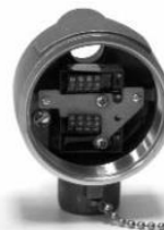
AC103528 mounting kit

The AC103528 mounting kit fits connection head models CH105, CH107, CH328, CH330, CH342, CH343, CH357, CH358, CH405 and CH407. It holds two miniature Temptrons in a single head for use with dual RTDs. Use AC103133 for connection head models CH104, CH106 and CH306, and CH356. CH106, CH306 and CH356 also require AC103625 connection head modification.