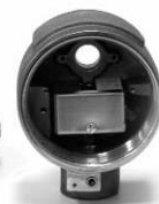
AC103133 mounting kit