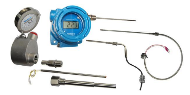
Application specific configurations engineered to provide performance and reliability