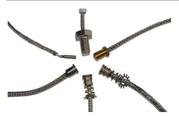
Designed for fast response and flexible mounting in harsh environments