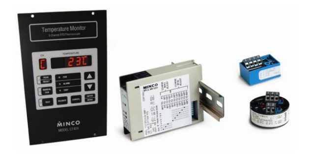
Range of capabilities to meet communication, monitoring and alarm requirements